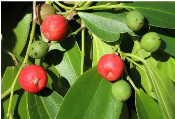
Each fruit contains a single hard-shelled seed