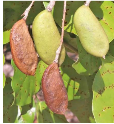
Smooth flattish oblong woody pods Jun-Sep/Oct