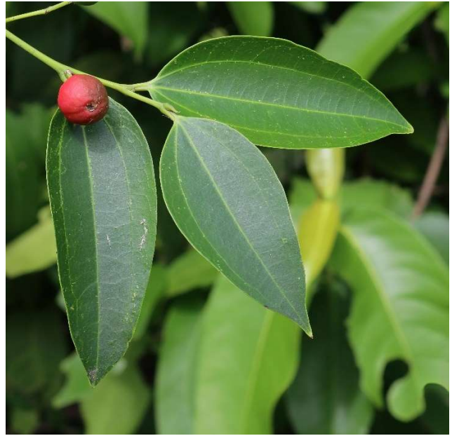
3 prominent longitudinal veins