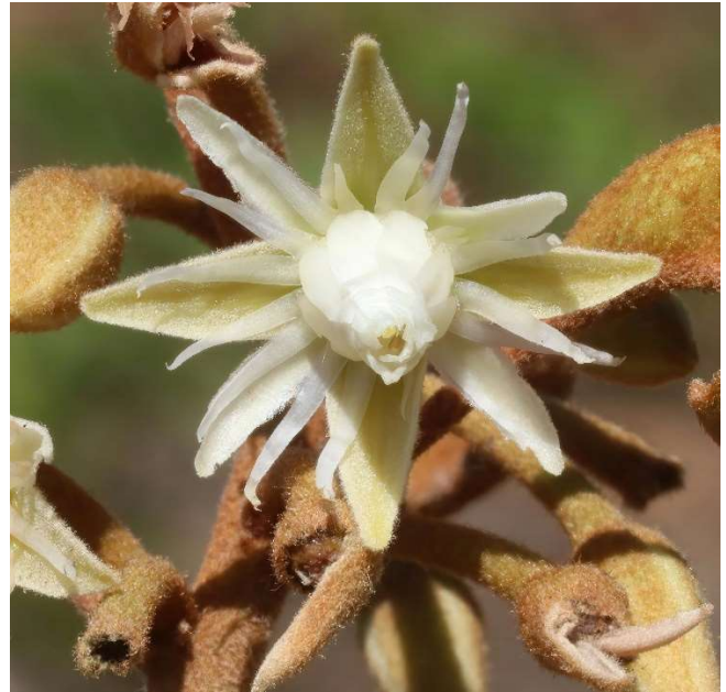
Flowers cream, hairy, scented Nov-Jan