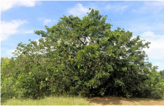
Dense-crowned spreading tree 5-20 metres high