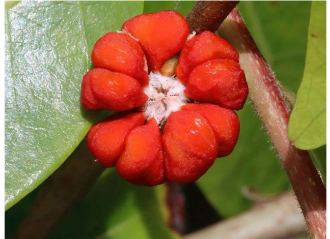
Bright red seeds