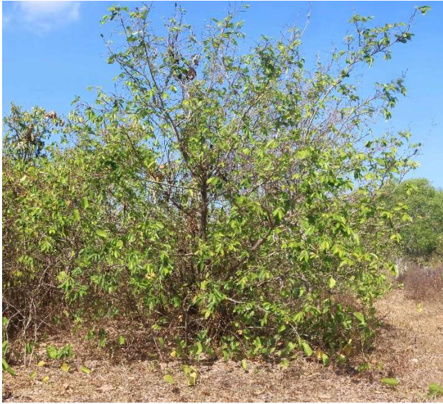
Small tree 3-7 metres high