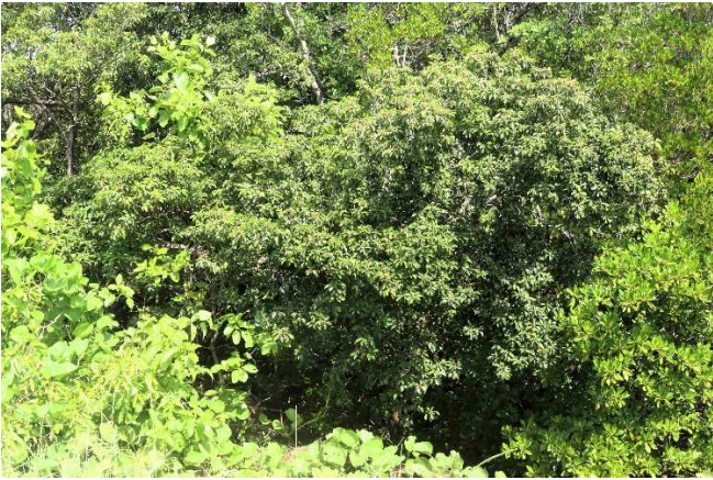
Large evergreen 10-15 metres