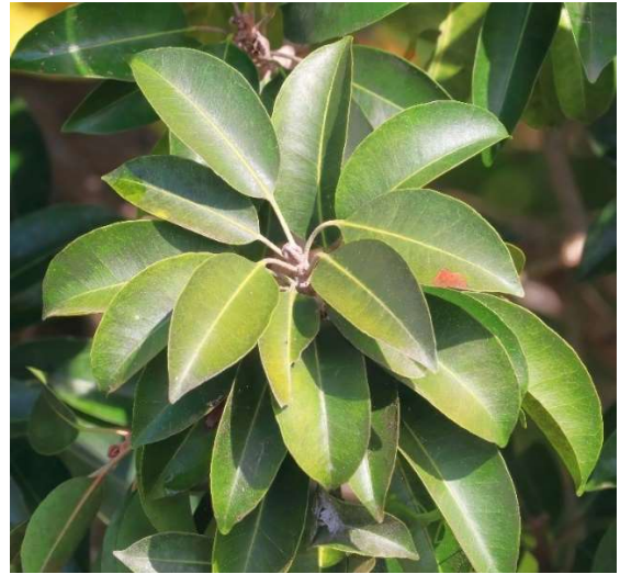
Leaves alternate, smooth, crowded, oval