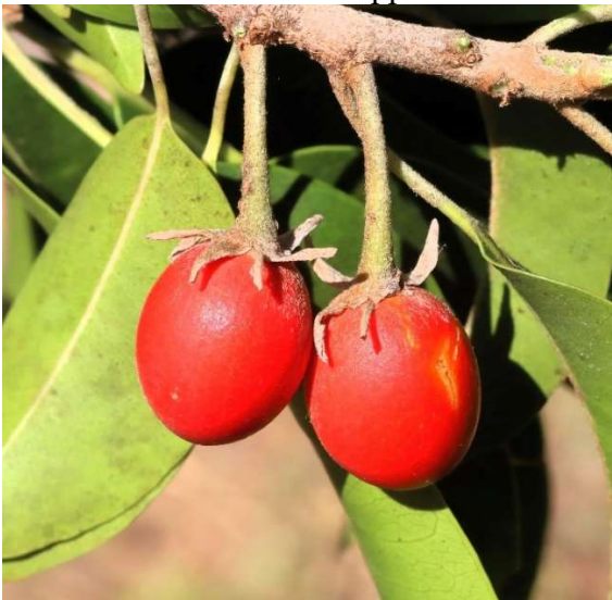
Fruit bright red when ripe; wedge-shaped seeds