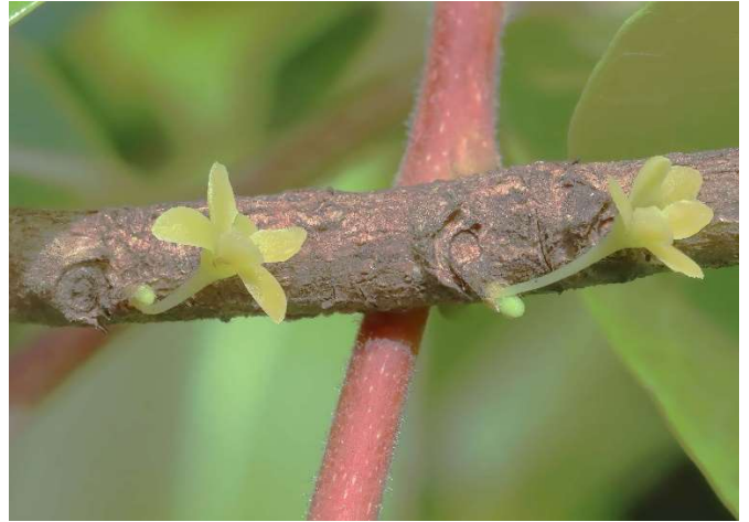
Male and female star-shaped flowers Jan-Mar