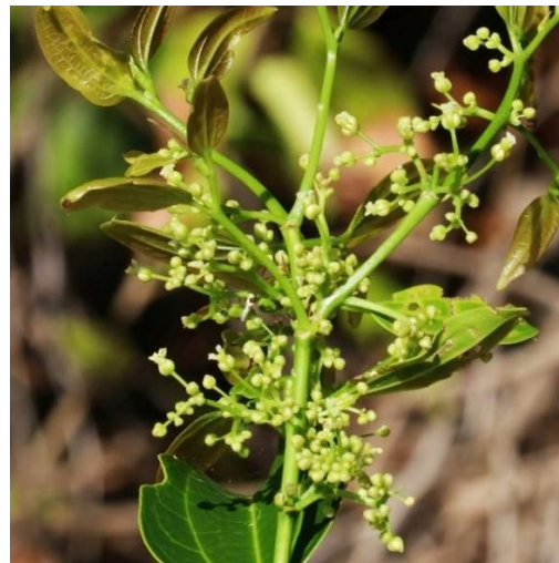
Flowers in small axillary clusters