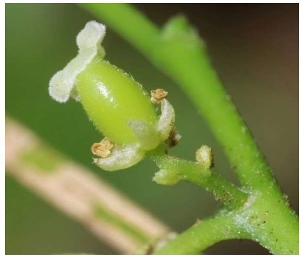
Unisexual and bisexual flowers on same tree