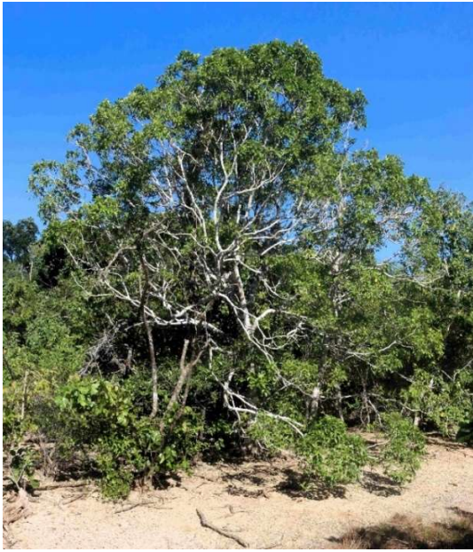
Medium sized tree 4-10 metres